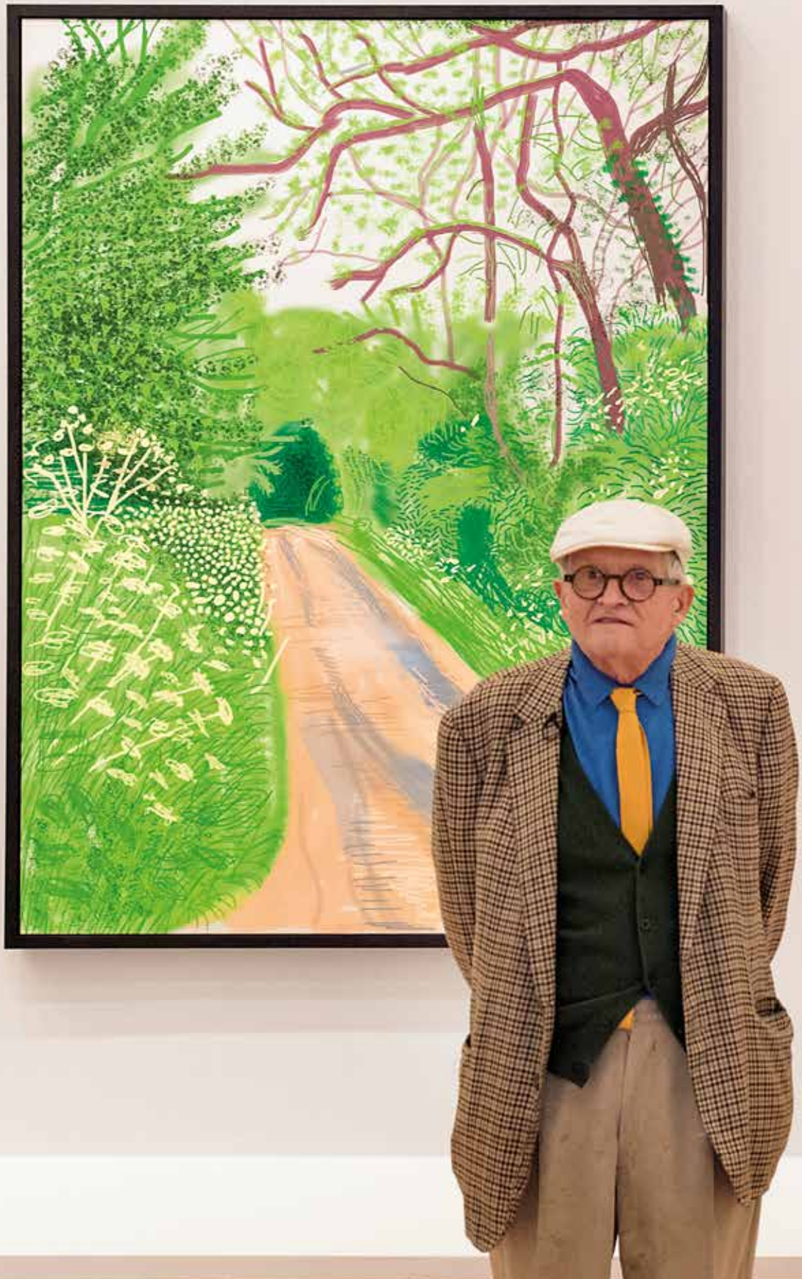
David Hockney in front of iPad drawings from The arrival of spring in Woldgate, East Yorkshire in 2011 (twenty eleven) in the exhibition David Hockney: Current at the National Gallery of Victoria, Melbourne, 2016