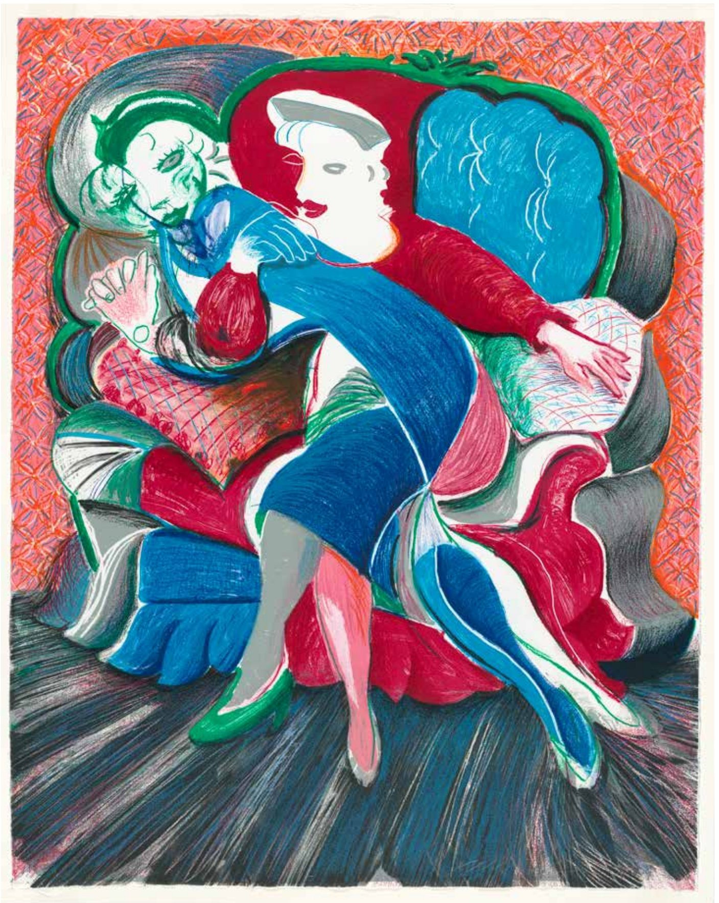
(right) David Hockney An image of Celia, state 1 1984–86, colour lithograph, National Gallery of Australia, purchased with the assistance of the Orde Poynton Fund 2002 © David Hockney