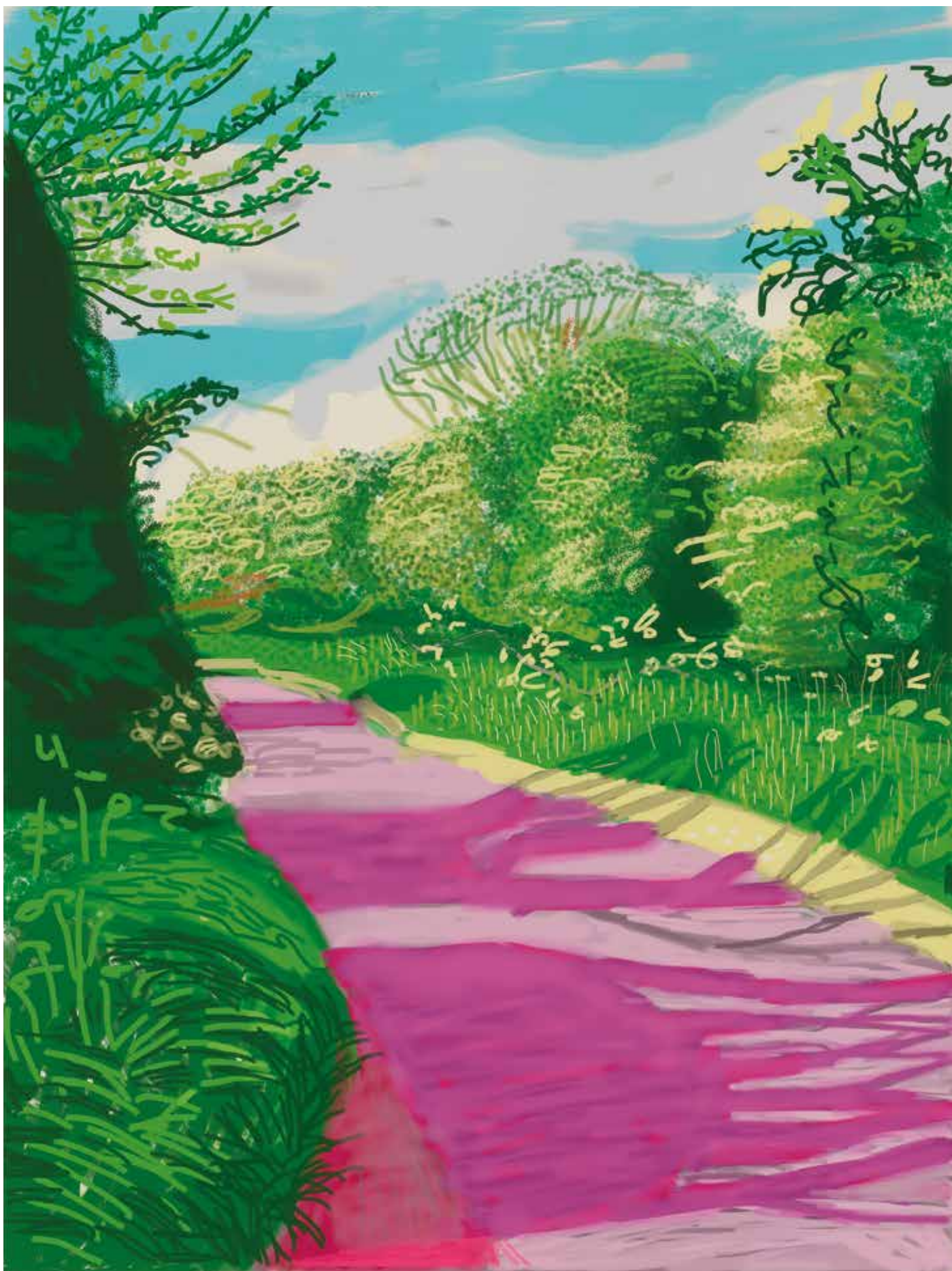
David Hockney The arrival of spring in Woldgate, East Yorkshire in 2011 - 31 May, No.2 2011 , iPad drawing digitally printed on paper, National Gallery of Australia, The Poynton Bequest 2015 © David Hockney