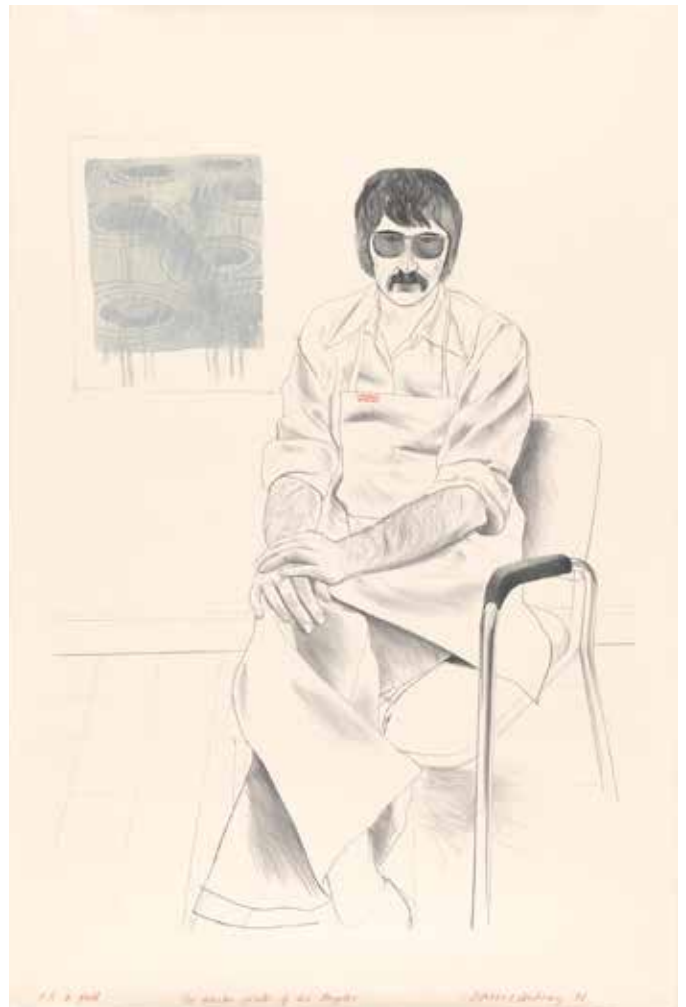
David Hockney The master printer of Los Angeles 1973, colour lithograph and screenprint, National Gallery of Australia, purchased 1973 © David Hockney