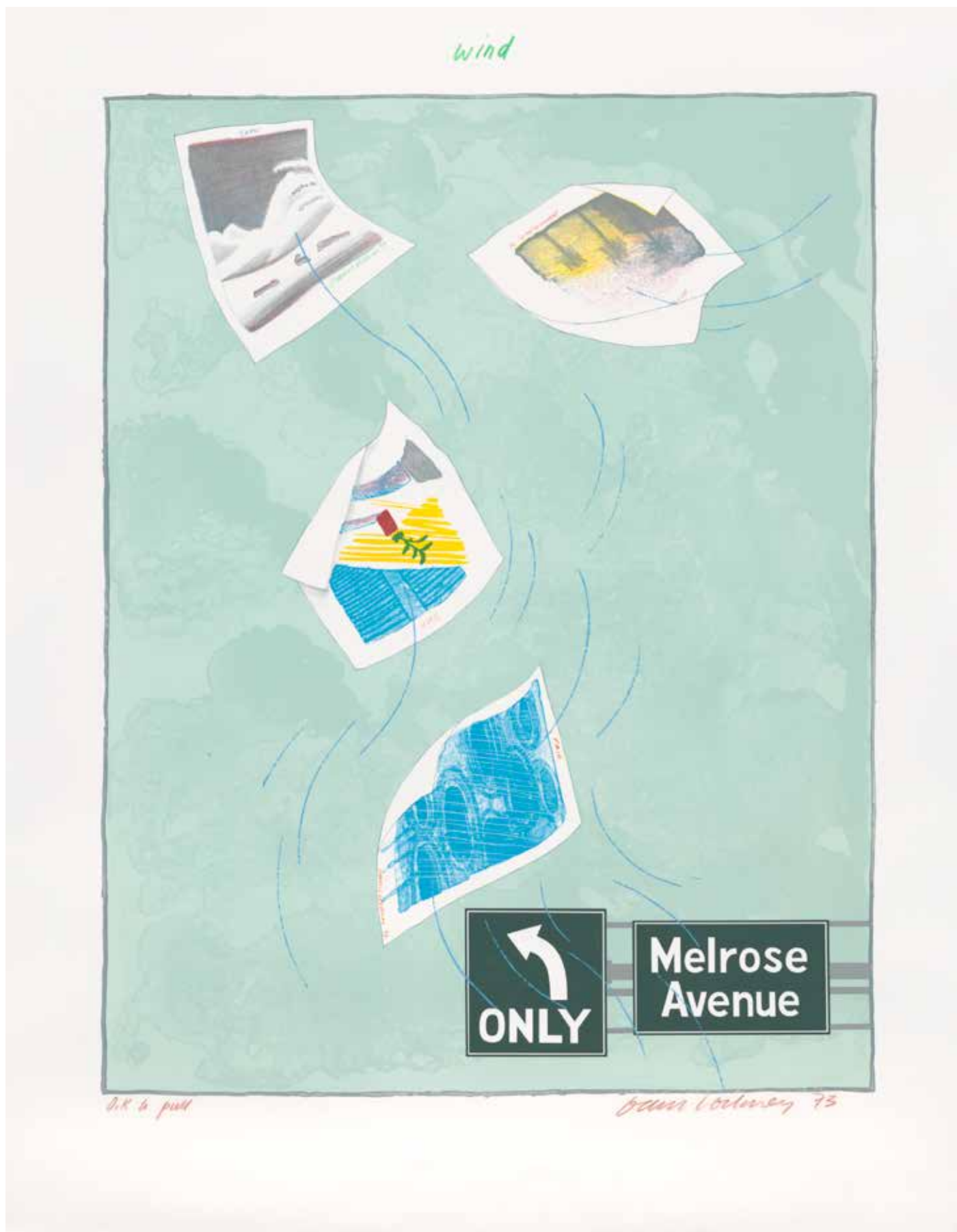
David Hockney Wind 1973, colour lithograph and screenprint, National Gallery of Australia, purchased 1973 © David Hockney