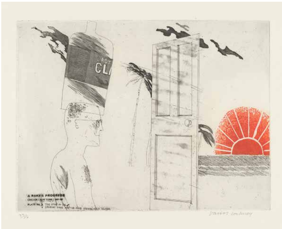
David Hockney The start of the spending spree and the door opening for a blonde 1961–63, colour etching and aquatint, National Gallery of Australia, purchased 1973 © David Hockney