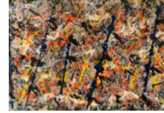
Jackson Pollock, Blue poles , 1952 Gallery 18, Lower Ground