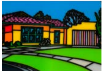
Howard Arkley, House and garden, Western suburbs, Melbourne , 1988 Gallery 21, Level 2