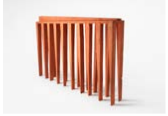
Louise Bourgeois, C.O.Y.O.T.E. , 1941–48 Gallery 16, Lower Ground