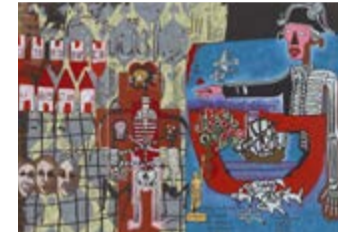
Gordon Bennett, Notes to Basquiat (The Death of Irony) , 2002 Gallery 21, Level 2