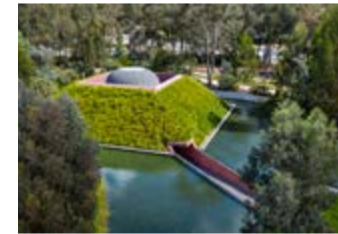
James Turrell, Within without , 2010 Skyspace Garden Skyspace light show, dawn and dusk daily