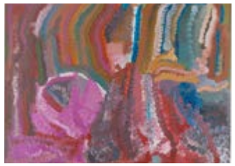
Emily Kame Kngwarreye, Anmatyerre people, The Alhalkere suite , 1993 Gallery 2, Level 1