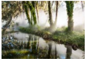
Fujiko Nakaya, Foggy wake in the desert: An ecosphere , 1982 Lakeside Sculpture Garden Operates daily 12.30–2pm