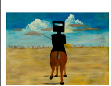
Sidney Nolan, Ned Kelly, 1946, Gallery 8 , Level 1