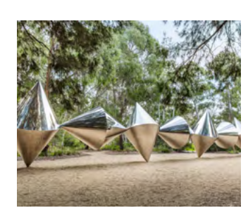
Bert Flugelman, Cones, 1982