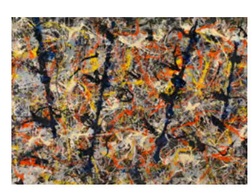
Jackson Pollock, Blue poles, 1952 Gallery 11, Level 1