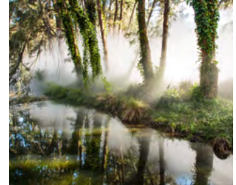
J. Fujiko Nakaya, Foggy wake in a desert: An ecosphere, 1982