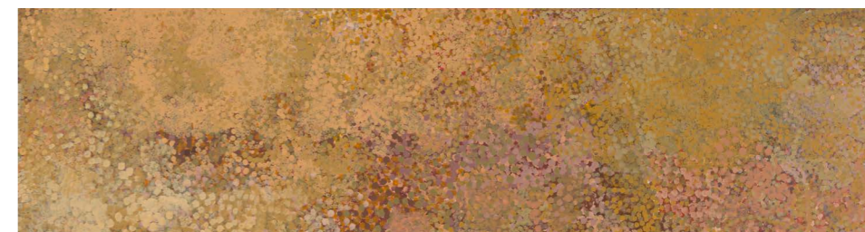
Emily Kam Kngwarray, Anmatyerr people, Alhalker - my Country , 1992, National Gallery of Australia, Kamberra/Canberra, Purchased in 2023 in celebration of the National Gallery of Australia's 40th anniversary 2022.

Wholesale vouchers for Emily Kam Kngwarray can be purchased through the Gallery's own ticketing portal on our website.