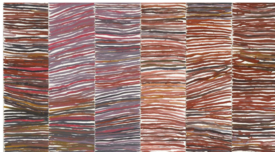
Emily Kam Kngwarray, Anmatyerr people, Untitled (awely) , 1994, National Gallery of Australia, Kamberra/Canberra, purchased 2022 with the assistance of the Foundation Gala Funds 2021 and 2022, in celebration of the National Gallery of Australia's 40th anniversary, 2022 © Emily Kam Kngwarray/Copyright Agency

Emily Kam Kngwarray exhibition is long overdue and will be a major survey of the artist's work at the National Gallery. The exhibition will feature as the Gallery's major summer exhibition 2023 and will showcase around 100/120 works covering paintings, textiles (batiks), sculptures, works on paper and other mediums. New works will be acquired for the national collection and additional key works will be sourced from private and public collections.