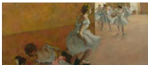
Théo van Rysselberghe

Why do you think Degas, in the composition of this painting, crops sections of the dancers' bodies?