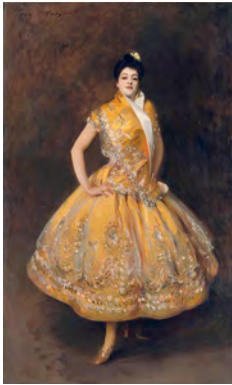
John Singer Sargent